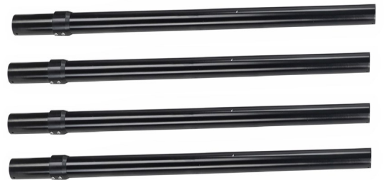
4 x (31" Length) Rods