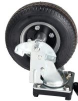
2 x Pneumatic Tires with Break