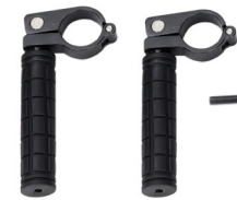
2 x Handles