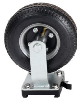
2 x Pneumatic Tires without Break