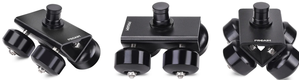
3 x Track Wheels

Please inspect the contents of your shipped package to ensure you have received everything that is listed below.