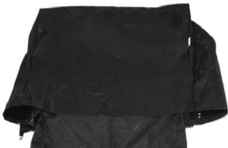
Sunshade for laptop workstations

Please inspect the contents of your shipped package to ensure you have received everything that is listed below.