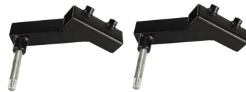
2 x Shank