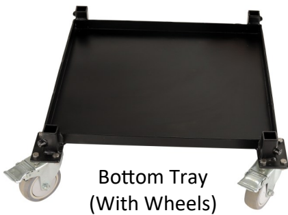
Bottom Tray (With Wheels)

Please inspect the contents of your shipped package to ensure you have received everything that is listed below.