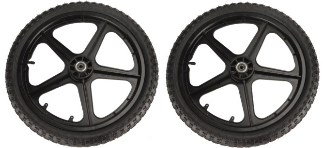
2 x Wheels