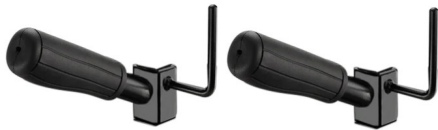
2 x Handles