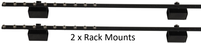
2 x Rack Mounts