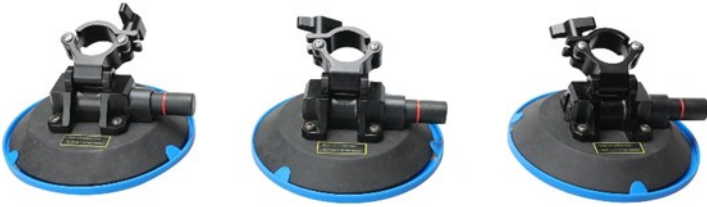
6" Suction Cups

Please inspect the contents of your shipped package to ensure you have received everything that is listed below.