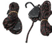
2 x Rope