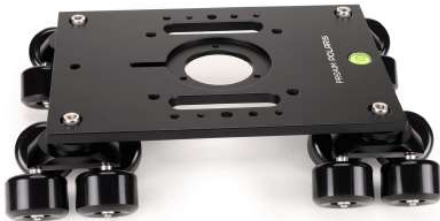
Polaris Dolly with 16 wheels (Part-1)

Please inspect the contents of your shipped package to ensure you have received everything that is listed below.