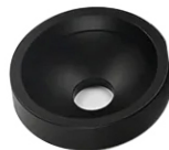
100mm Bowl Adapter (Part-6)