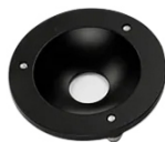
75mm Bowl Adapter (Part-5)