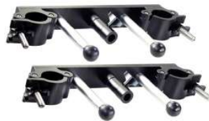
2 x Universal Track Ends (Part-2)