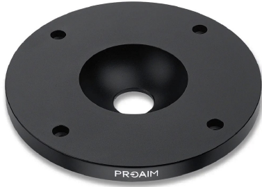
Mitchell Base to Bowl Camera Adapter (75mm)

Please inspect the contents of your shipped package to ensure you have received everything that is listed below.