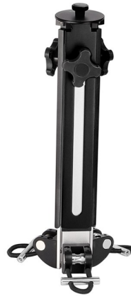
Aluminum Tripod Spreader