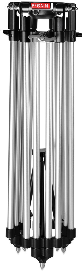
150mm Camera Tripod Stand

Please inspect the contents of your shipped package to ensure you have received everything that is listed below.