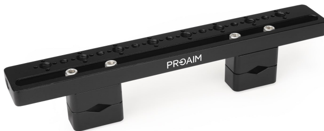
Proaim Headrest Car Mount

Please inspect the contents of your shipped package to ensure you have received everything that is listed below.