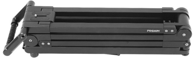
Proaim FlexLift Folding Camera Stand