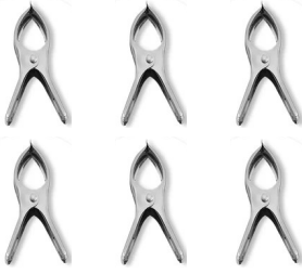
Backdrop Support Spring Clamp

Please inspect the contents of your shipped package to ensure you have received everything that is listed below.