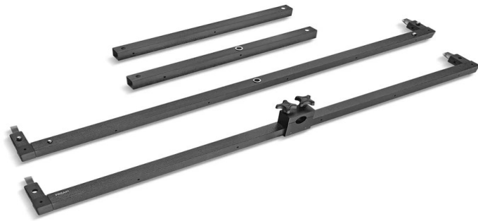
Proaim Background Frame