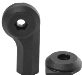
Boom Pole Adapter