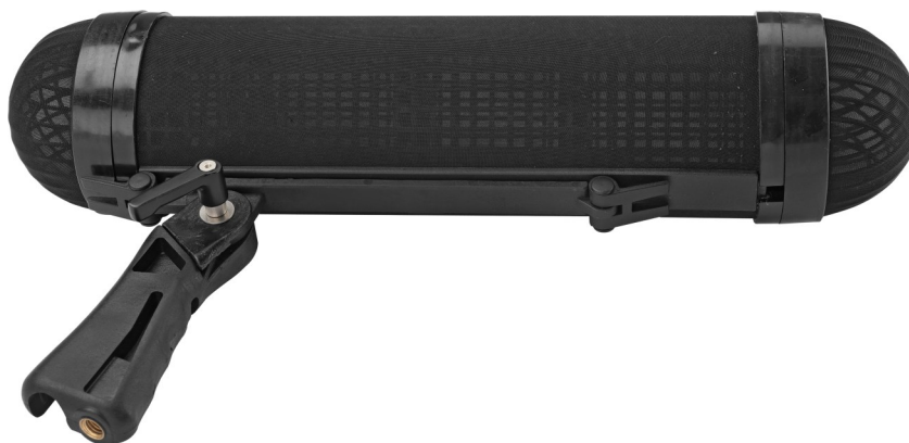
Proaim BMP60 R Pro Long Blimp Microphone Windscreen with Pistol Grip Handle