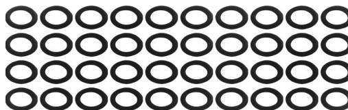
Rubbers 40 Pcs