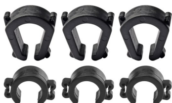
6 x Mic Holders