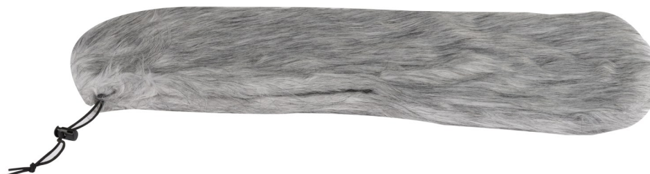
60cm Modular Windjammer