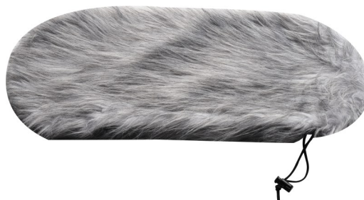
40cm Modular Windjammer