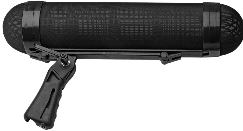
40cm Blimp Windshield with Microphone Suspension with Pistol Grip Handle

Please inspect the contents of your shipped package to ensure you have received everything that is listed below.