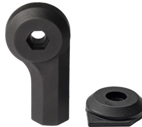
Boom Pole Adaptor