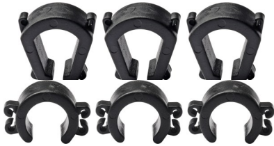
6 x Mic Holders