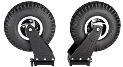
2 x Pneumatic Wheels (without Brake)