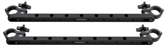
2 x Cross Bar