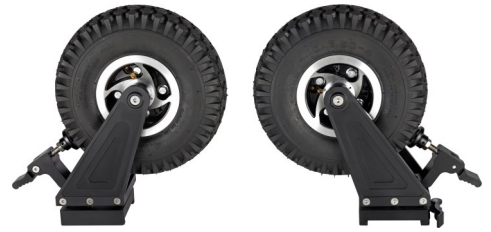
2 x Pneumatic Wheels (with Brake)