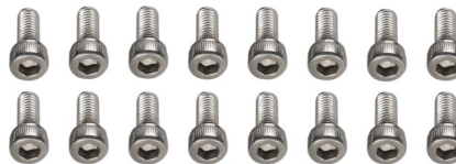
16x Allen Bolts (Size: 5 x 12mm)