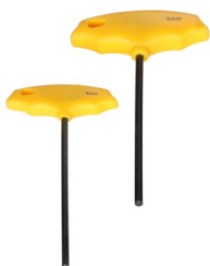
2 x T-Type Allen Key (Size: 4mm & 5mm)