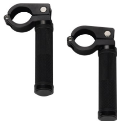
2 x Side Handle