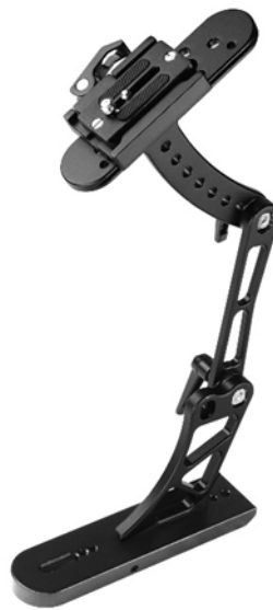
Camera Support Bracket