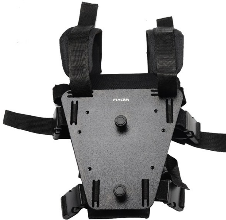
Flycam Telephoto Vest

Please inspect the contents of your shipped package to ensure you have received everything that is listed below.