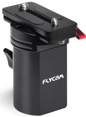
Flycam Arm & Vest Gimbal Adapter

Please inspect the contents of your shipped package to ensure you have received everything that is listed below.