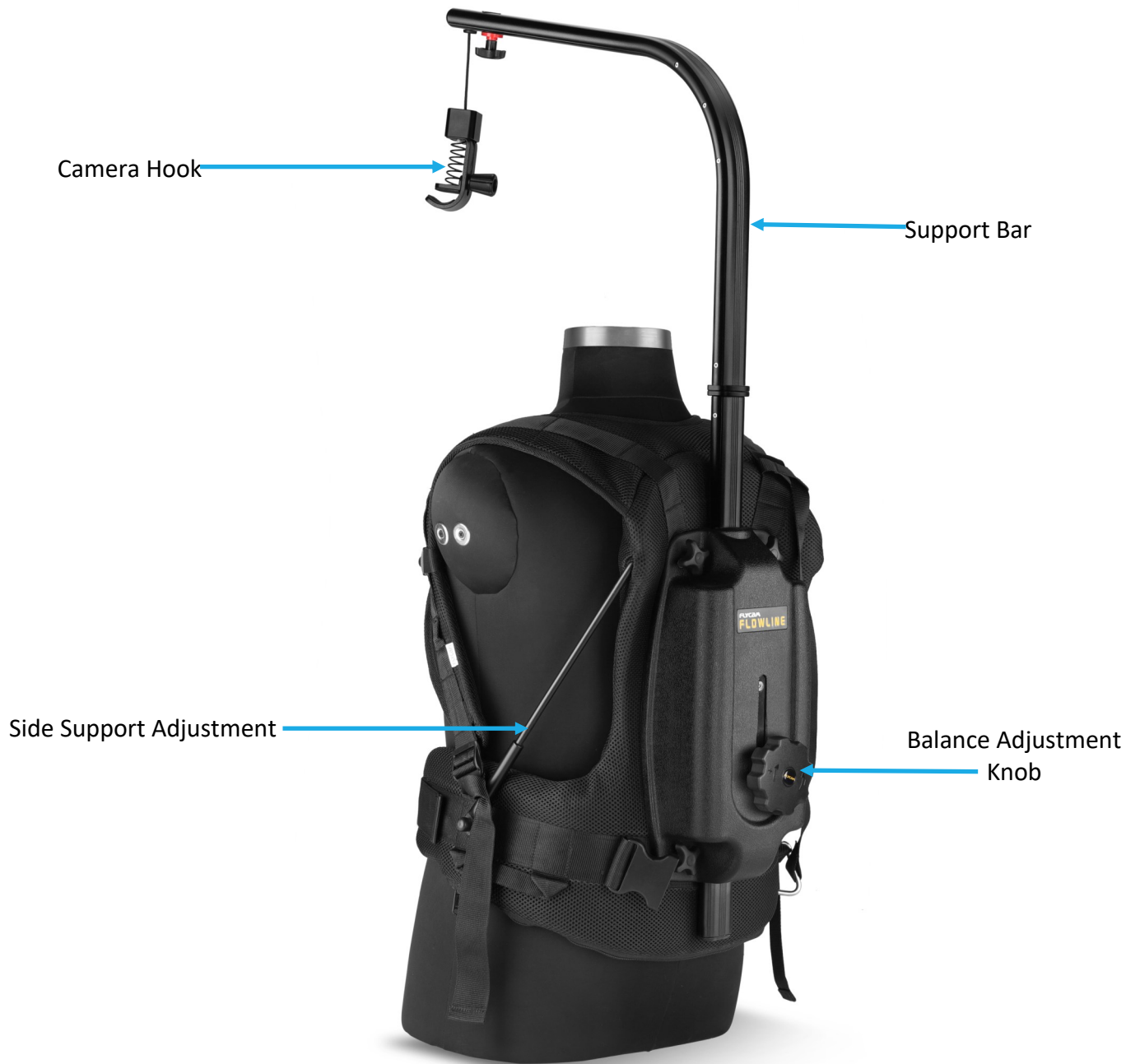
Flycam Flowline Starter Body Rig