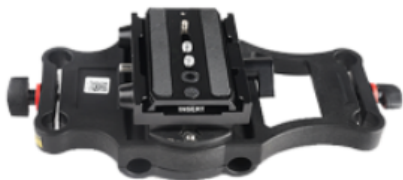
Camera Base with Quick Release

Please inspect the contents of your shipped package to ensure you have received everything that is listed below.