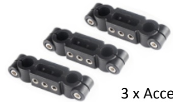
3 x Accessory Mounting Adapter