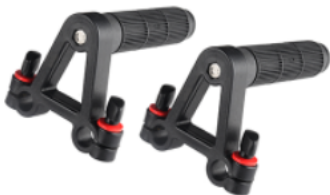
2 x Side Handles