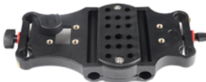
Cage Top Plate